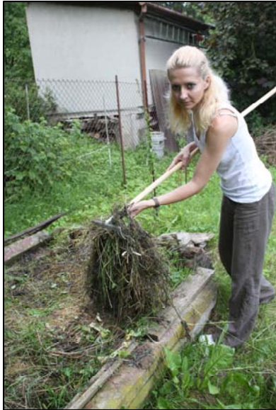
Fig.: You may preferably compost the raked-out grass

When the spring comes, some gardeners, instead of much more ecological raking and composting, burn the old grass. It is not only a dangerous act, but it also decimates fauna and flora, and pollutes the air. For these reasons it is prohibited by several laws to burn grass. They are: the Law of Fire Protection, the Law of Conservation of Nature and Landscape, and the Law of Air Protection.