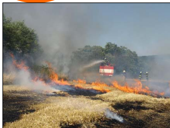
Fig.: even disposing of a cigarette butt can cause fire

Do you know how to make a fire in nature safely or why you should not burn grass? The Fire Rescue Service of the South Moravian Region in partnership with the Police of the Czech Republic – the city police headquarters of Brno and Diocesan Charity of Brno will provide you with the instructions how to handle these events safely.