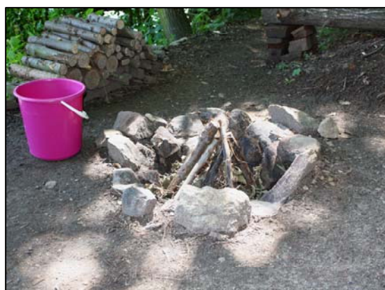
Fig.: before you start a fire, make sure you have enough water to put it out

Remember that you can make a fire in the forest, but only in designated areas, and that smoking is completely prohibited by the law there. (In disregard of this prohibition you can be fined up to