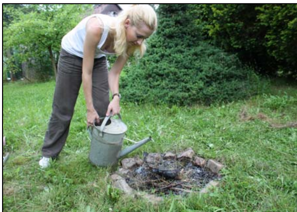
Fig.: always put out the fire properly

– the best you can do is to pour water over the fire properly, or put it out with soil. The fireplace must not be smoking when you are leaving, and the ash and soil underneath must be cool. Remember that even apparently cold fireplace can be hiding burning cinders. They can get blown on by a gust of wind and the wind will carry them to vicinity.